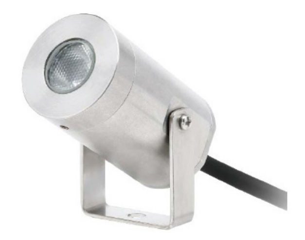
Maximum Vertical adjustment tilt 60 °